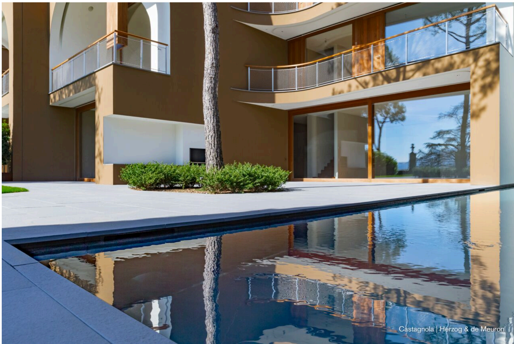
Castagnola | Herzog & de Meuron