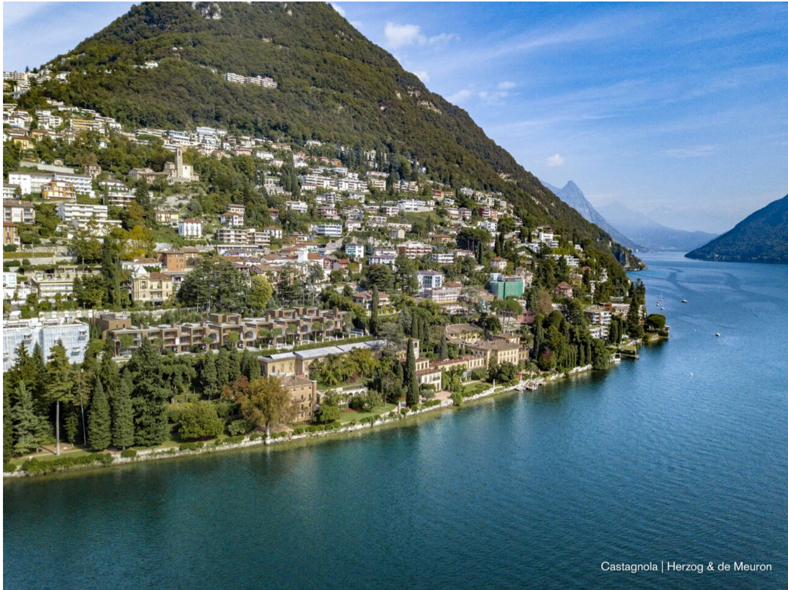
Castagnola | Herzog & de Meuron