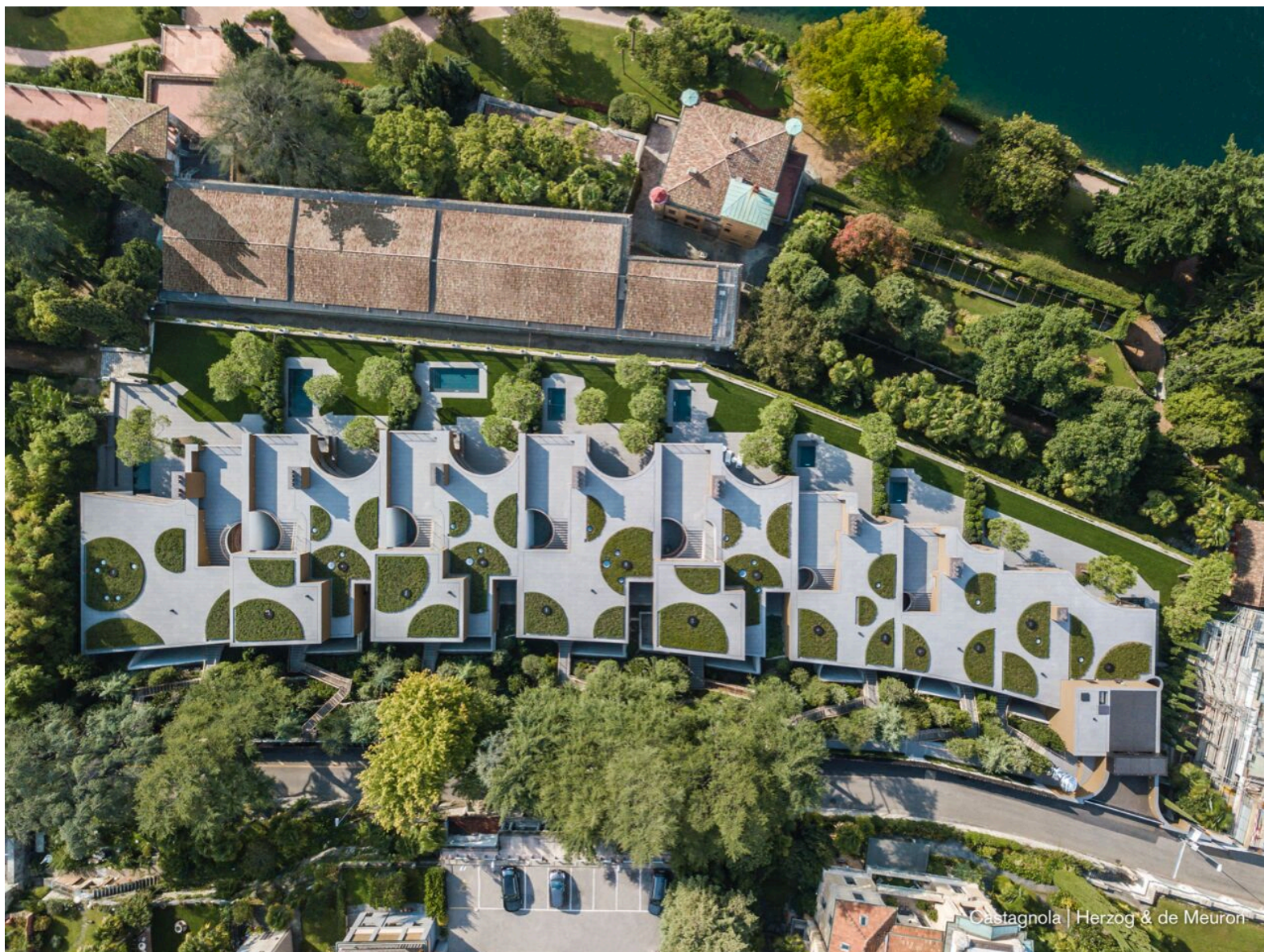
Castagnola | Herzog & de Meuron