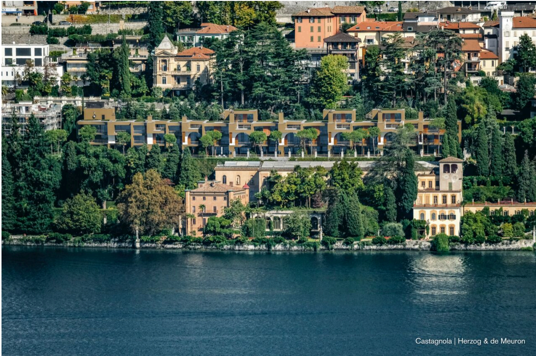
Castagnola | Herzog & de Meuron