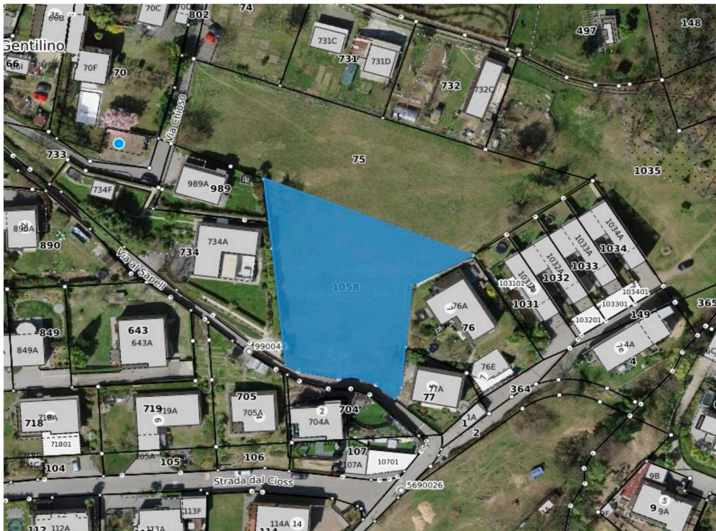
Plan cadastra de parcelle