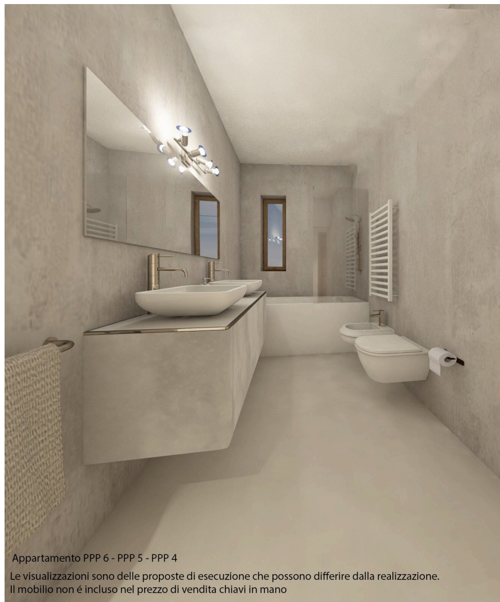
Appartamento PPP 6 - PPP 5 - PPP 4

Le visualizzazioni sono delle proposte di esecuzione che possono differire dalla realizzazione. Il mobilio non é incluso nel prezzo di vendita chiavi in mano